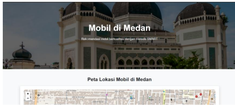
Figure 2. Used Car Recommendation Page