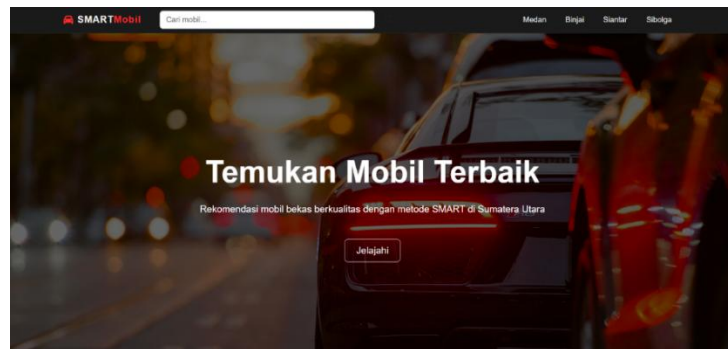
Figure 1. Home Page Interface

The home page serves as the main interface displayed when users access the application. This page provides general information regarding the system and introduces the main functionality of recommending used cars based on the SMART method.